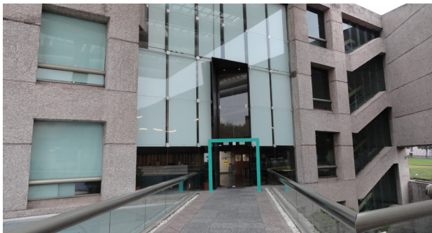
Customer Engagement Center

Mexico CEC contact: mexico.eg.presales@hpe.com